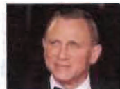
9 used-to-be homeless stars