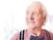
Top Investor Reveals 38 Investments That Profit 96% of the Time...